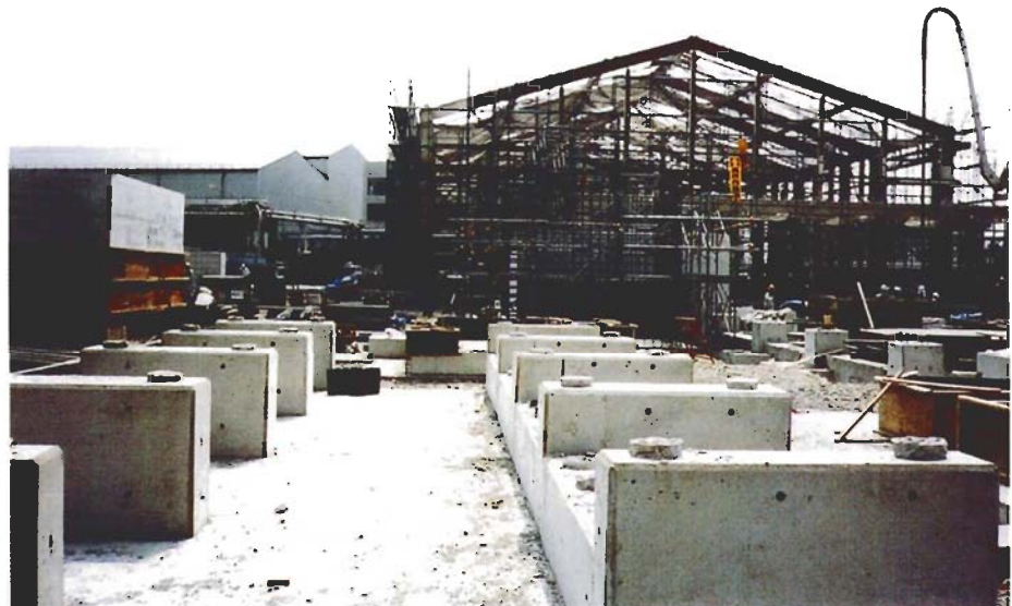
Reducing Agent for Blast Furnace (under construction)

These activities comply with the Law for Promotion of Sorted Collection and Recycling of Containers and Packaging (June 1995). PWMI will continue to further push itself and promote plastic waste recycling—including material and thermal recycling.