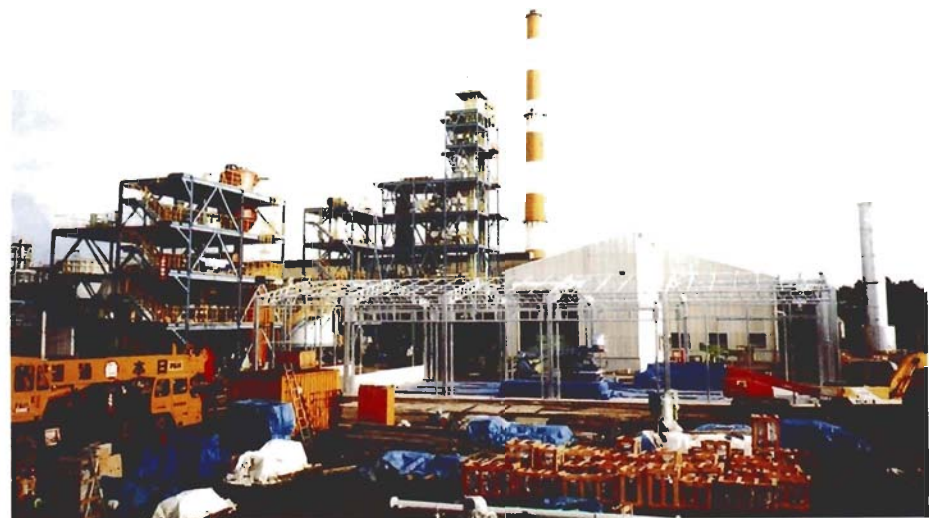
Gasification Plant (under construction)